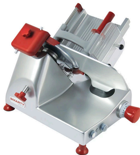
Smarty 250 IX (Red)