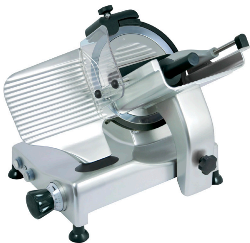
Smarty 250 IX (Black)